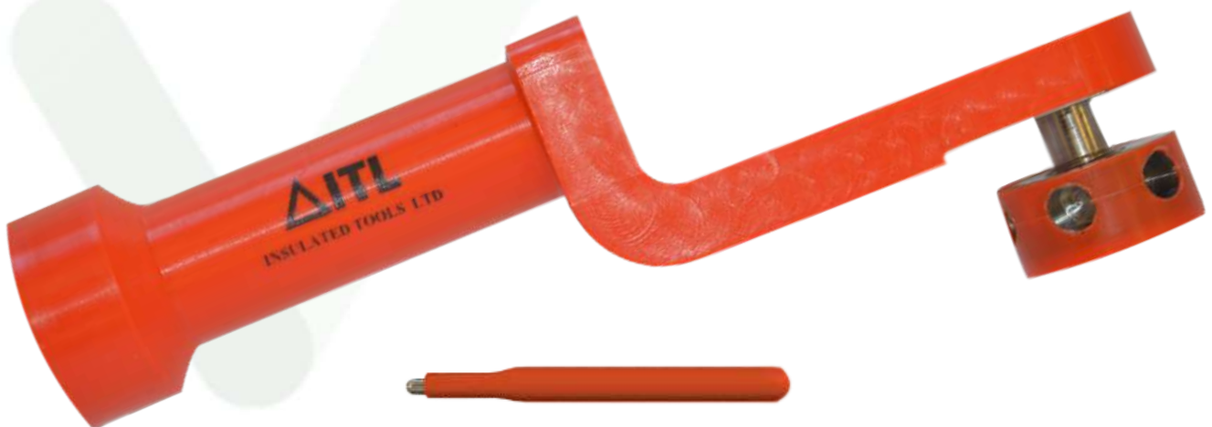
AP000027 = Tool

* Standard use is Source Connection. If you require Drain connectors please ask.