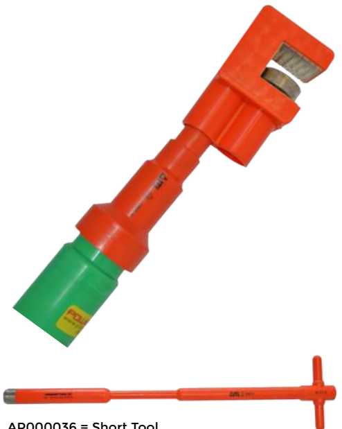
AP000036 = Short Tool AP000028 = Long Tool

* Standard use is Source Connection. If you require Drain connectors please ask.