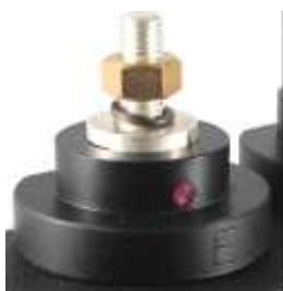
M12 Cable Lugs